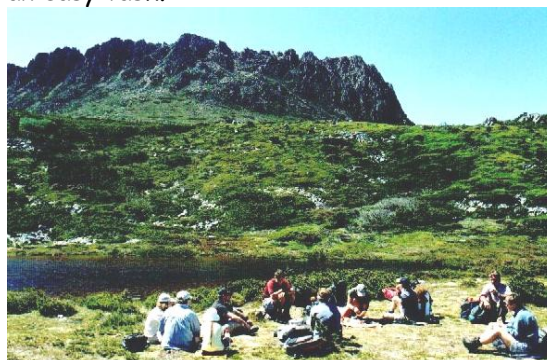
lunch break before we start our climb

we set out for our afternoon hike. This 7 - 8 kms hike on a very well-maintained trail took us to small lakes, waterfalls and through the Ballroom Forest, a temperate rainforest of myrtle and pencil pine. Although the trail was wet and rugged in places, the climb to the top of the ridge was rewarded by magnificent views of the Tasmanian Highlands. Got back to our cabin around 6pm, totally exhausted from the heat and hike. While we relaxed with a cup of coffee and some wildlife watching, our guides made a wonderful dinner for us. Up by 7am the next morning to another beautiful, sunny day for hiking. Today we attempt an ascent of Cradle Mountain, not an easy task.