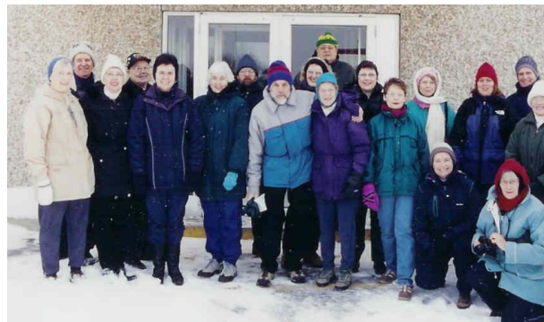
Jan 1, 2004