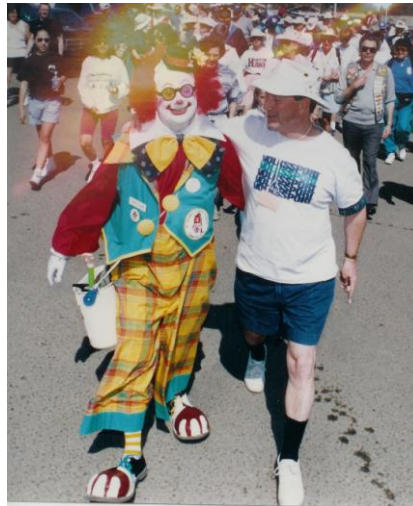
May 1994 – Presidents Walk CVF Convention-St Albert, AB