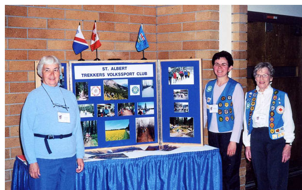
Several of our loyal volunteers running our table at the AGM.

display to the AGM and staffed our table there.