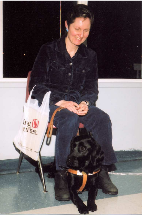
What good is being the newsletter editor if you can't get your wife's picture in your newsletter?