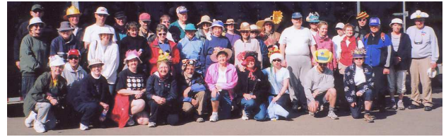
Our brave crew on a rather windy day.