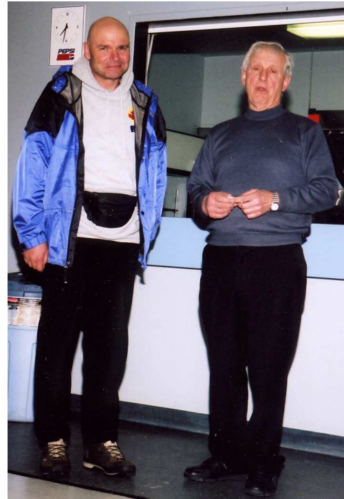
Perhaps a little friendly persuasion going on here?