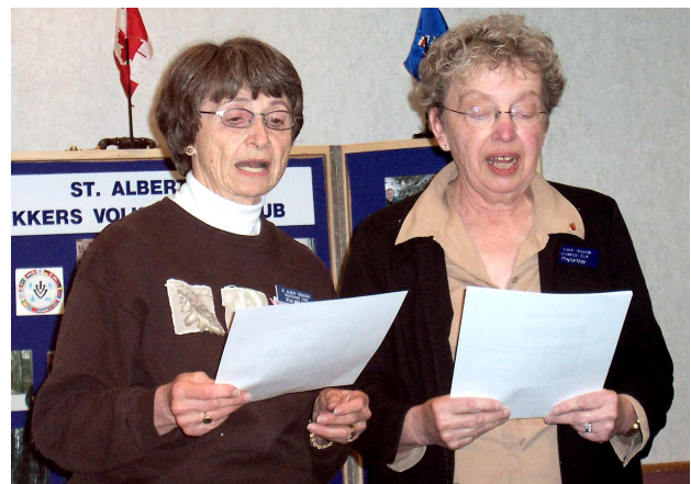
Being serenaded at the VAA AGM.