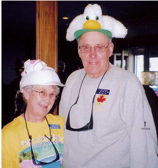
No jokes about the walk being "just ducky!"