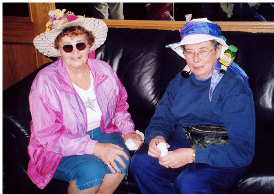
If you look closely, you can see that someone needed a little extra medication today!