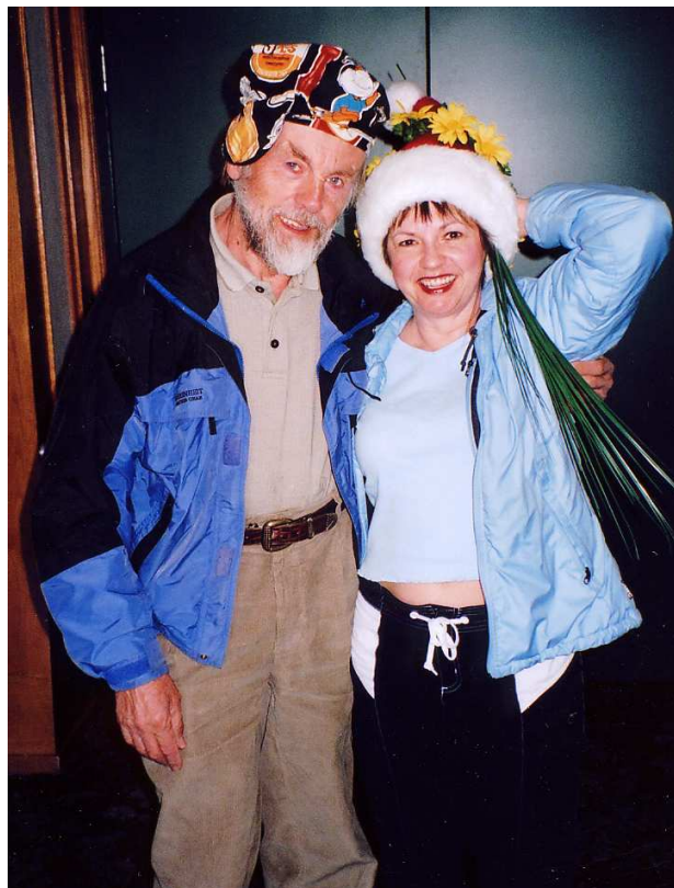
Our Trekkers fashion models—at home on any runway or park trail!