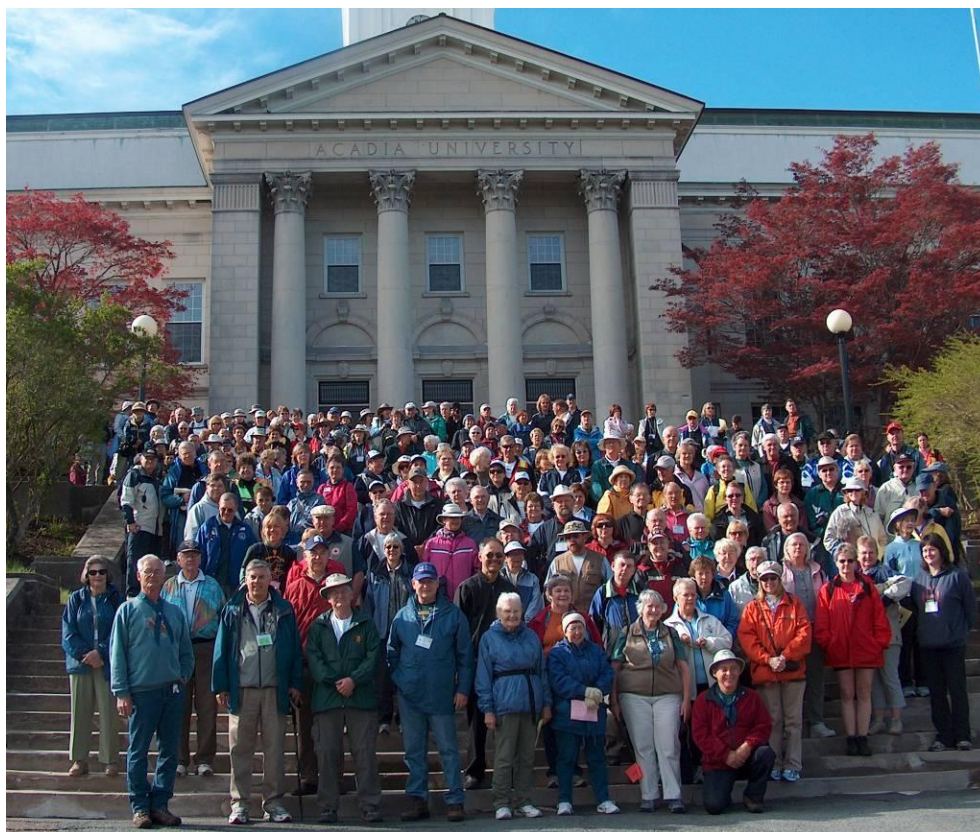
CVF Convention, Wolfville, NS - May 23 6 25 - 2008