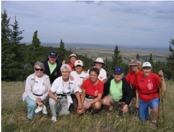
Cyprus Hills 2009