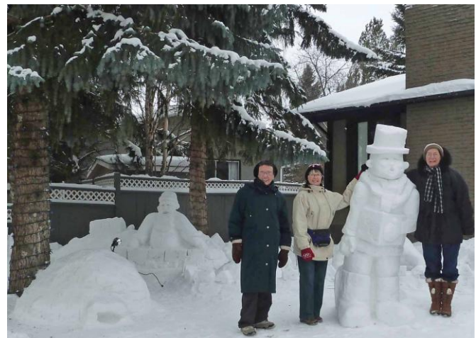
Welcoming in 2011!