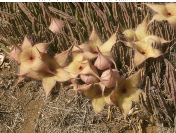
Blooming Cactus along the trail