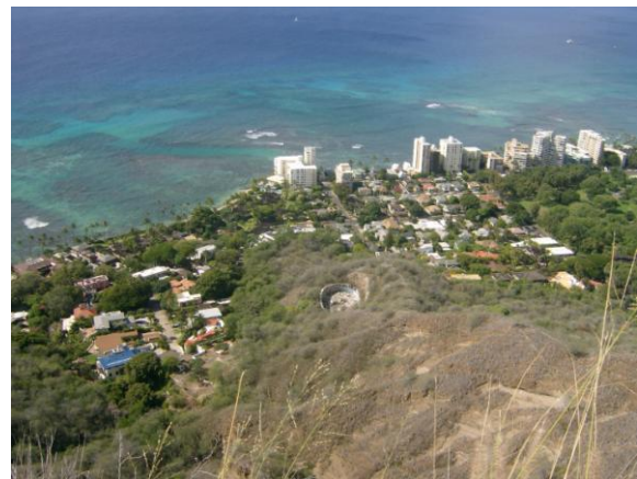
View of Honolulu from Diamond Head