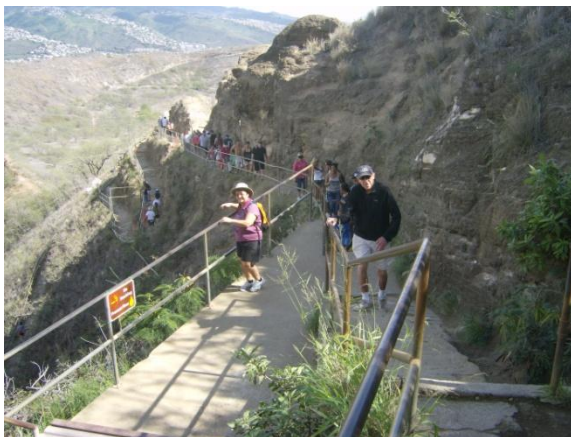
Trail to Diamond Head Summit

The website http://ava.org/menehunemarchers has a list and description of eight 10KM walks including the start point for each. All start points can be reached by the bus system.