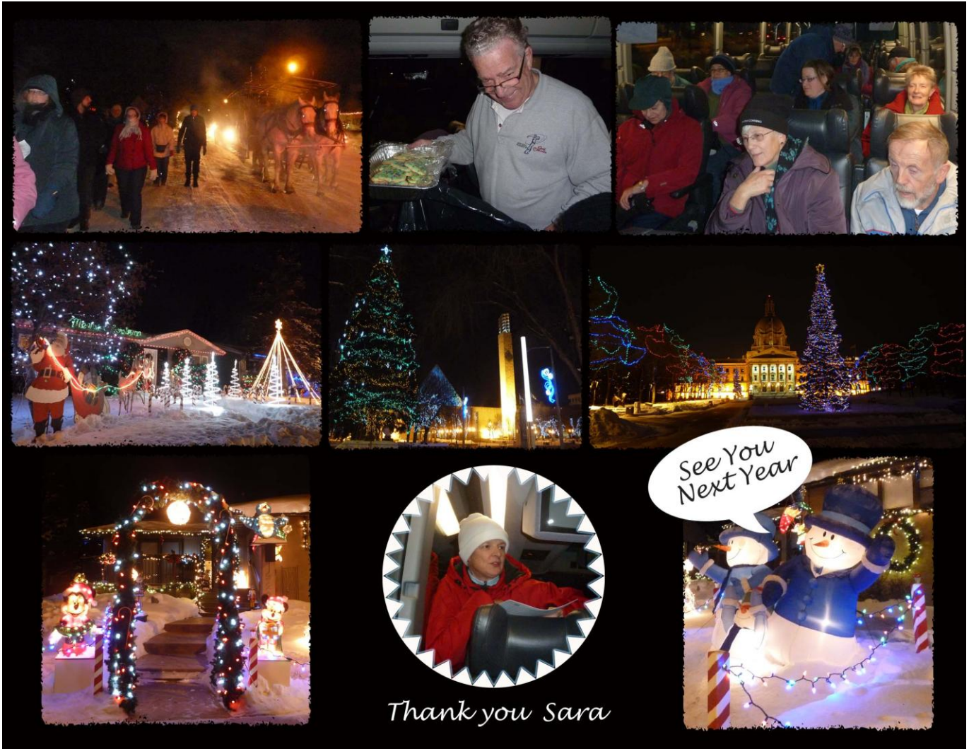
Bundled up warmly, filled with Christmas goodies and spirit, and a crisp evening walk down candy cane lane, then from city hall through downtown to the legislature grounds – what a great way to celebrate the season!